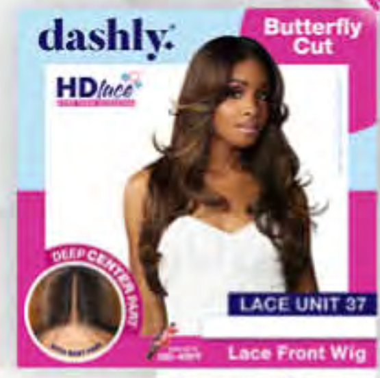
LACE UNIT 37 Color Shown: CHUNKY HIGHLIGHT 27