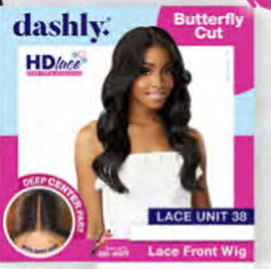
LACE UNIT 38 Color Shown: 1B