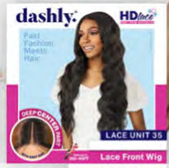
LACE UNIT 35 Color Shown: 1B