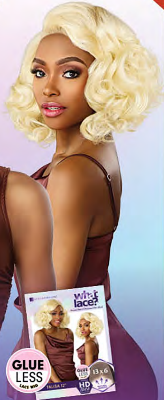
TALISA 12" HUMAN HAIR & PREMIUM FIBER BLEND

Available colors: 1, 1B, 2, DIMENSIONAL HIGHLIGHT APPLE RED, DIMENSIONAL HIGHLIGHT BUTTERY BLONDE, DIMENSIONAL HIGHLIGHT CREAM BLONDE, DIMENSIONAL HIGHLIGHT GINGER, DIMENSIONAL HIGHLIGHT GOLDEN BLONDE, DIMENSIONAL HIGHLIGHT GOLDEN BRONZE, DIMENSIONAL HIGHLIGHT PLATINUM