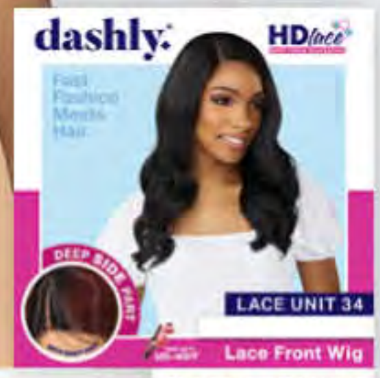
LACE UNIT 34 Color Shown: 1