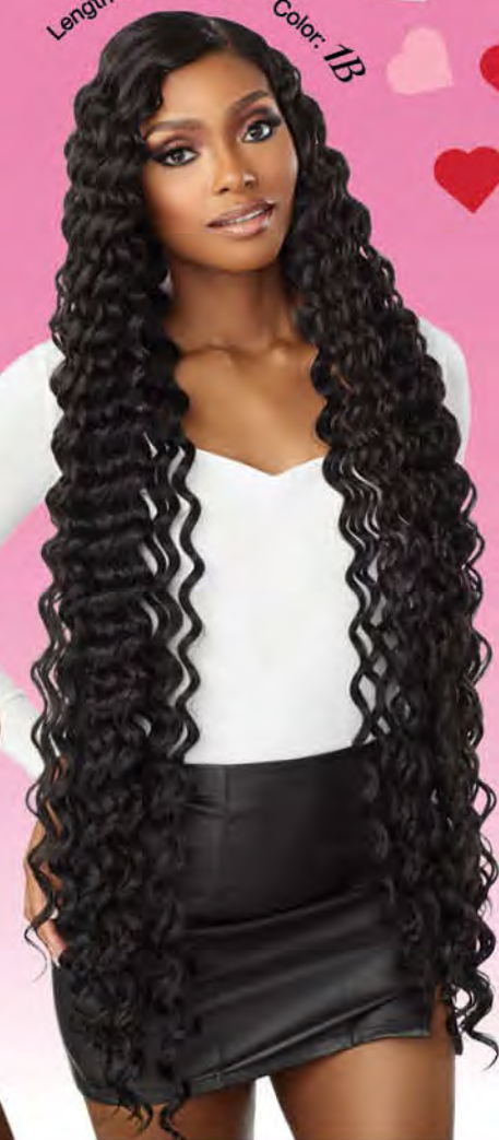
Style Name: BOHO CURL