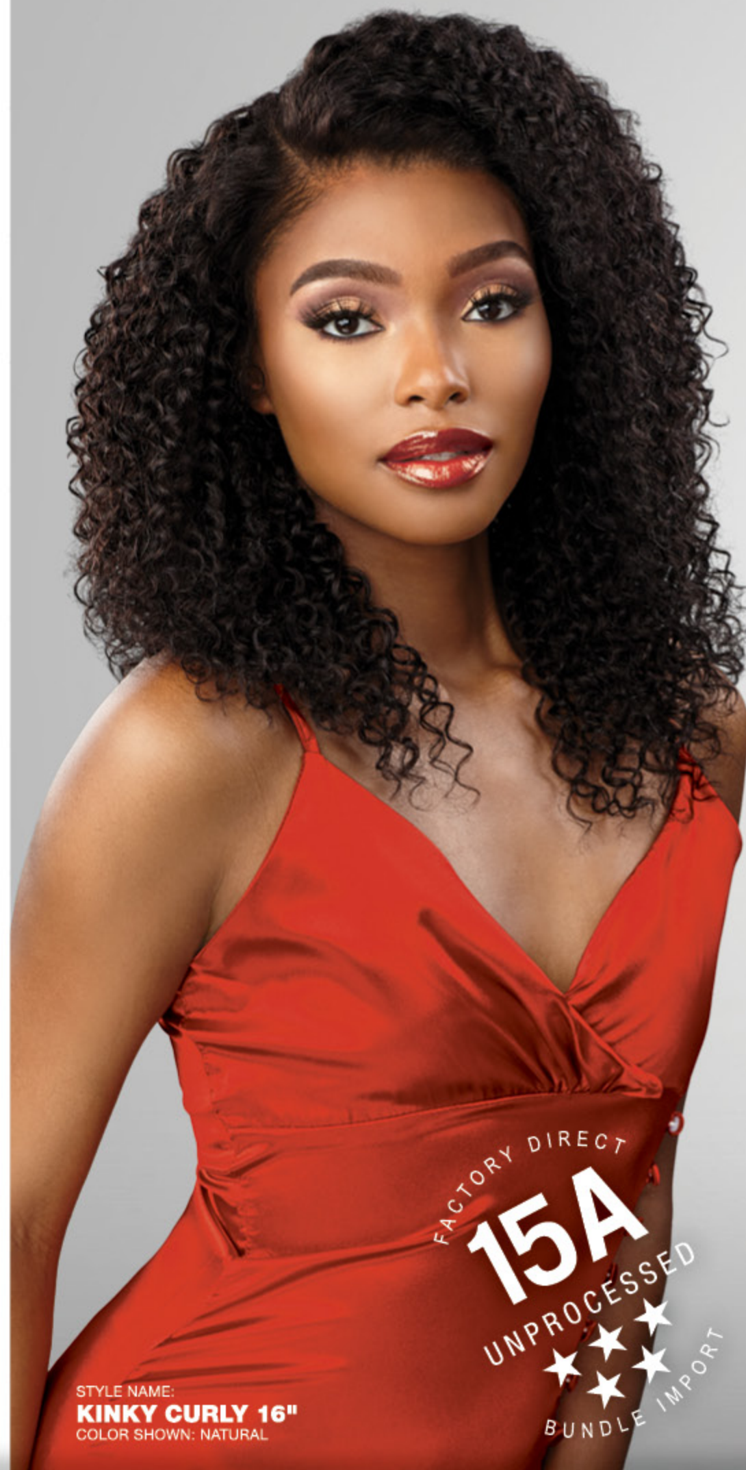
STYLE NAME: KINKY CURLY 16" COLOR SHOWN: NATURAL