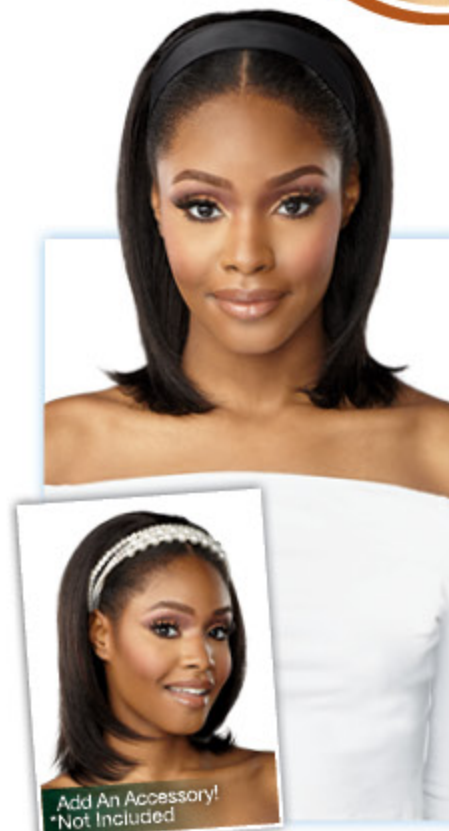
STRAIGHT 14" Color Shown: Natural Black