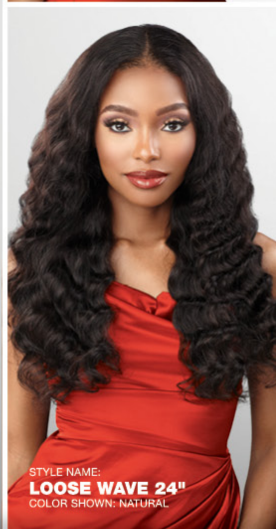
STYLE NAME: LOOSE WAVE 24" COLOR SHOWN: NATURAL