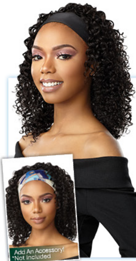
BOHEMIAN 14" Color Shown: Natural Black