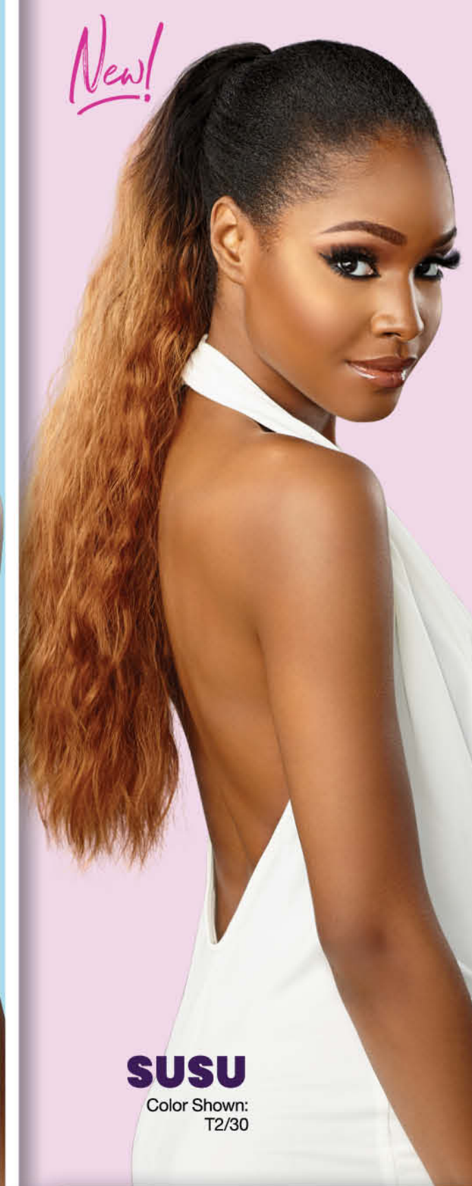
SUSU Color Shown: T2/30

AVAILABLE COLORS: 1, 1B, 2, 4, F1B/30, T2/27, T2/30, T2/BG