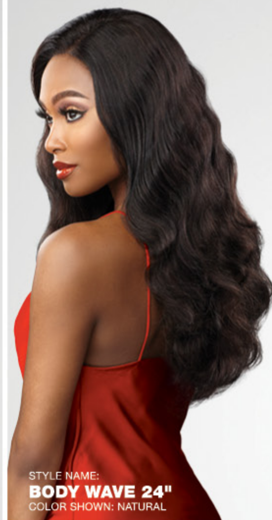
STYLE NAME: BODY WAVE 24" COLOR SHOWN: NATURAL