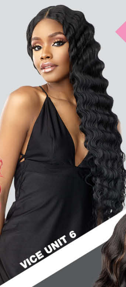
VICE UNIT 6

Available Colors: 1, 1B, 2, CHUNKY HIGHLIGHT 27, CHUNKY HIGHLIGHT 30, T2/27, T2/30, T2/350, T2/BG, T2/RED