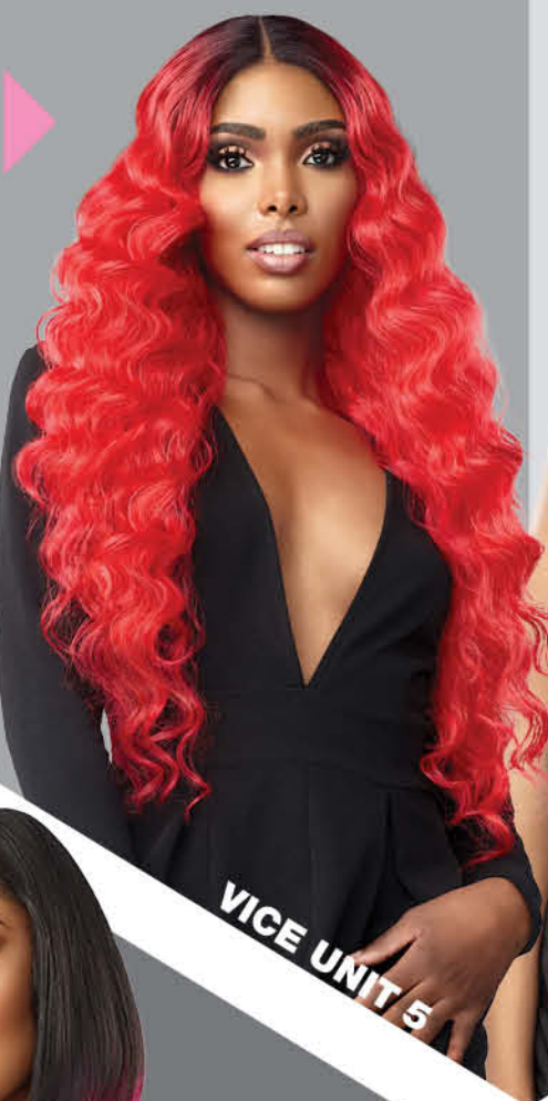
VICE UNIT 5