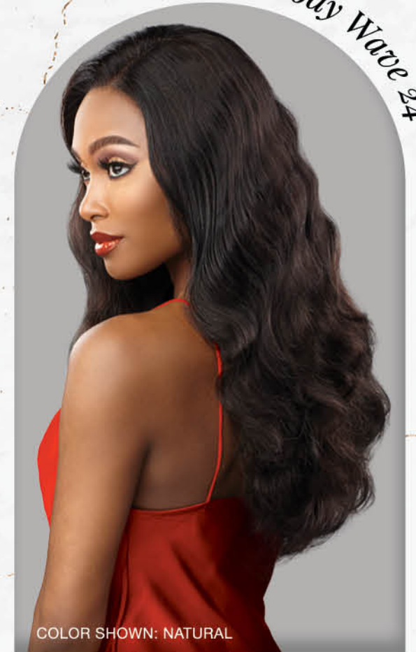
COLOR SHOWN: NATURAL