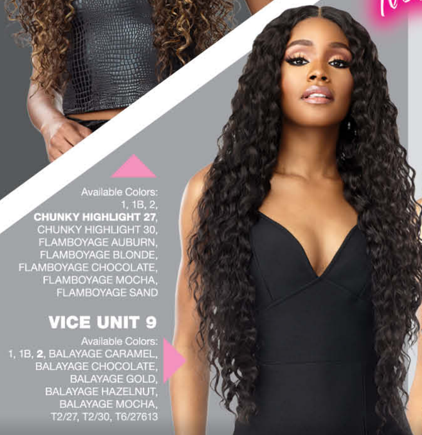
VICE UNIT 9