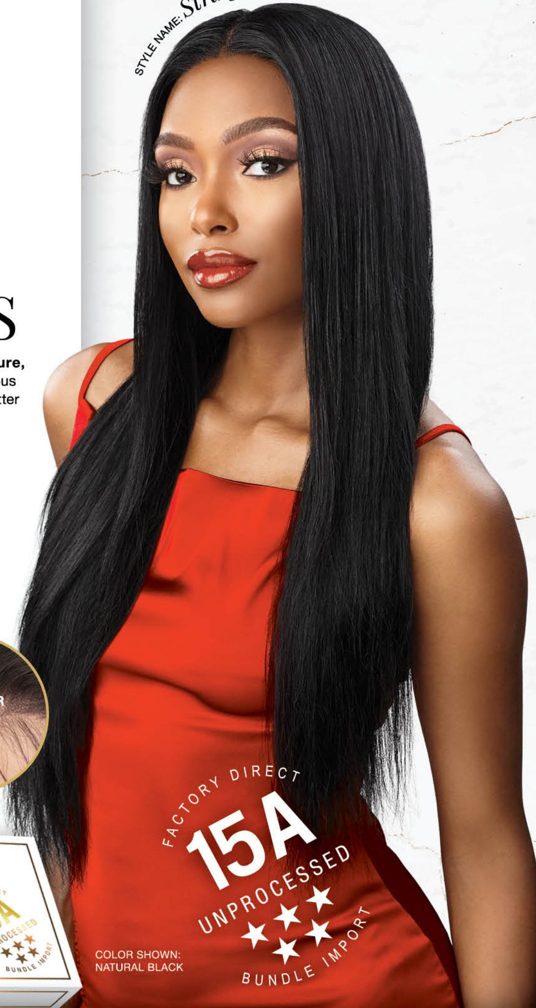
COLOR SHOWN: NATURAL BLACK