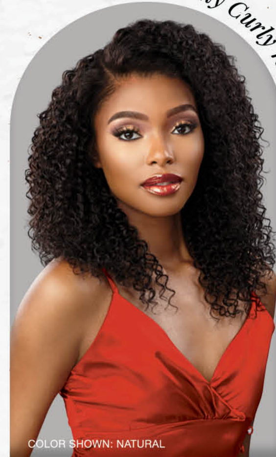
COLOR SHOWN: NATURAL