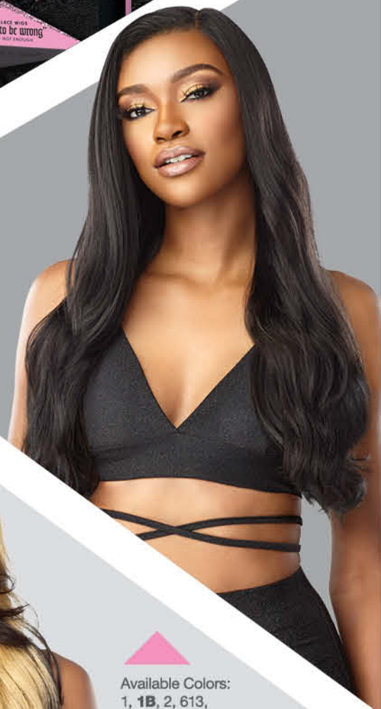
VICE UNIT 2