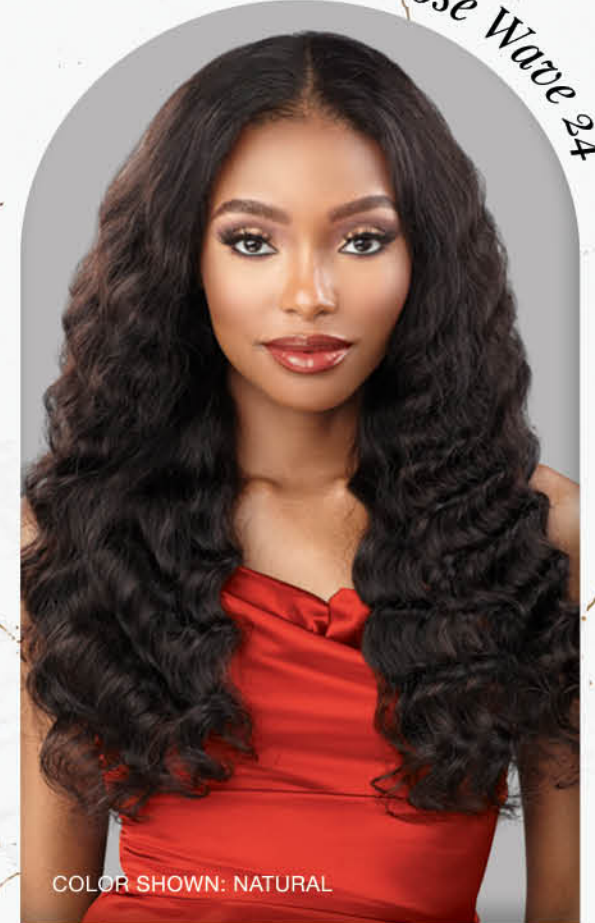
COLOR SHOWN: NATURAL