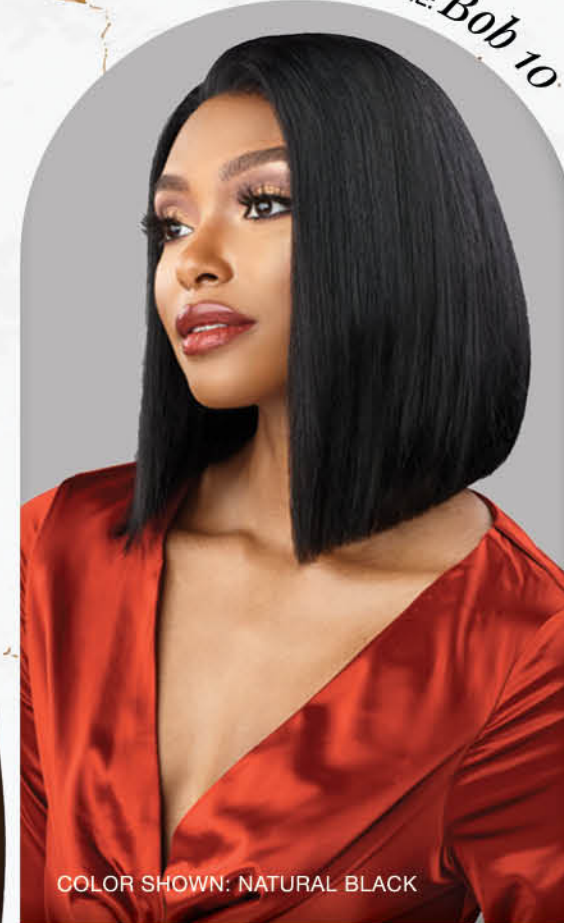
COLOR SHOWN: NATURAL BLACK