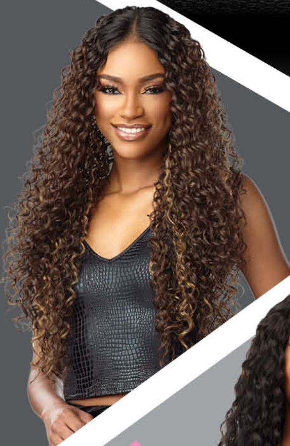
VICE UNIT 1

VICE® HD LACE WIGS "too good to be wrong" ONE IS JUST NOT ENOUGH