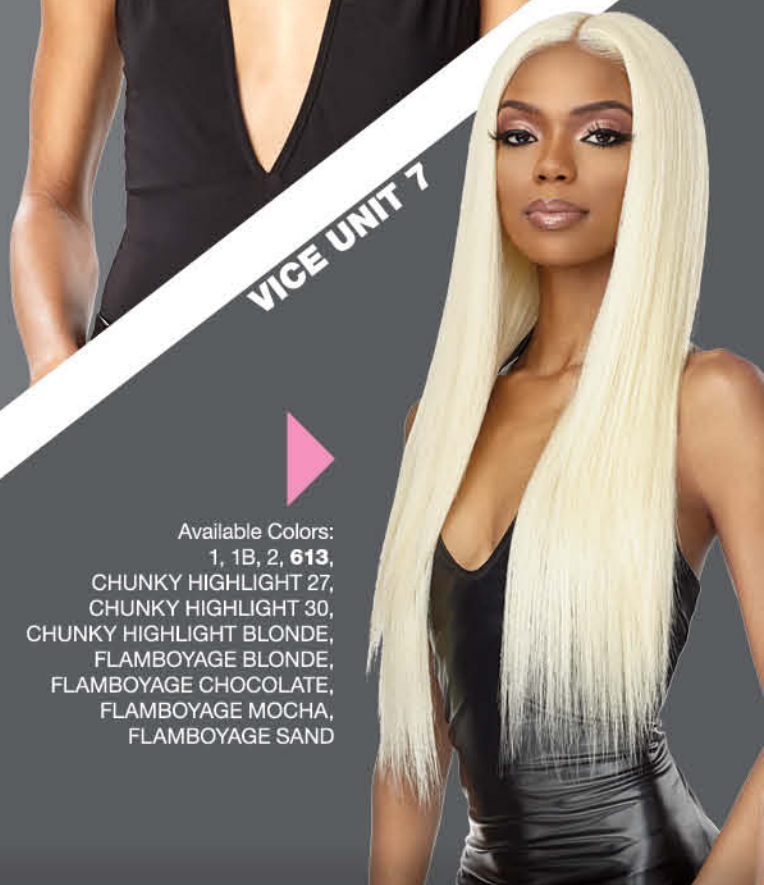
VICE UNIT 7